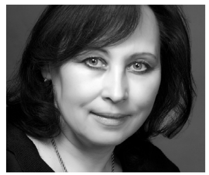
Irina Dolzhenko debuts as the Countess in the production of The Queen of Spades by Rimas Tuminas — September 18

National Artist of Russia <u>Irina Dolzhenko</u> appeared for the first time as the Countess in the production The Queen of Spades by Rimas Tuminas.