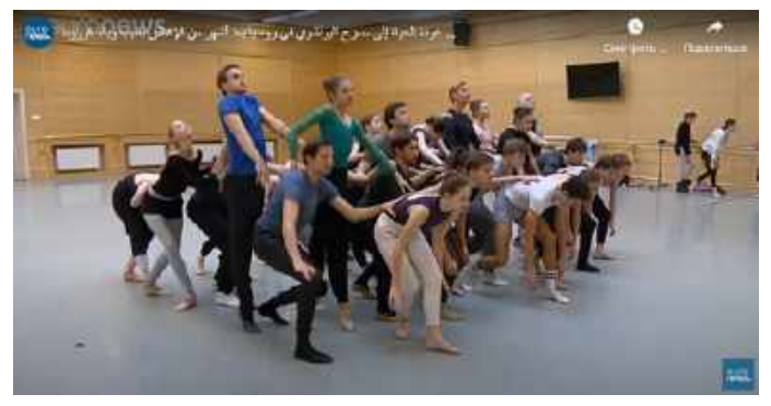
Euronews broadcasts the report in Arabic

The Argentinian news publication <u>Diario El Argen-</u> <u>tino</u> announces the reopening of the Bolshoi Theatre "After being closed for six months due to the coronavirus pandemic, the legendary Bolshoi Theatre in Moscow reopened its doors yesterday, with all 50% of the enabled seats occupied. Season 245 started with the opera Don Carlos by Giuseppe Verdi, performed by Anna Netrebko and Ildar Abdrazakov, for which the seats had been