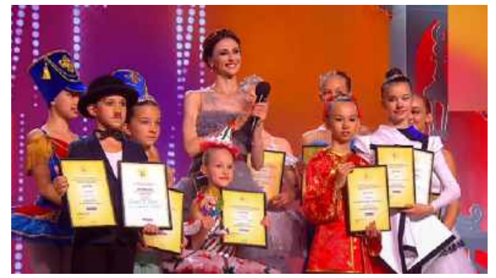
Project Big and Small – kicked off on September 19 on <u>Kultura TV channel</u>

Rossiiskaya Gazeta Nedelya has announced a new season of the project Big and Small, which is dedicated to children and teenage dancing on the Rossia K TV channel. The project is led by prima ballerina Svetlana Zakharova. The first episode was aired live on September 19.