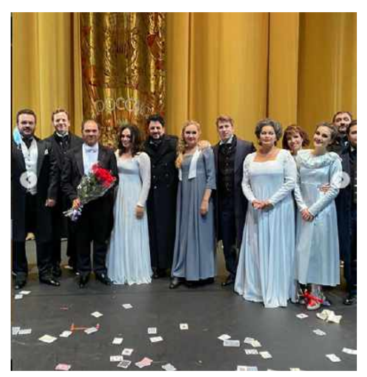
Artists backstage after the performance of The Queen of Spades on September 16.