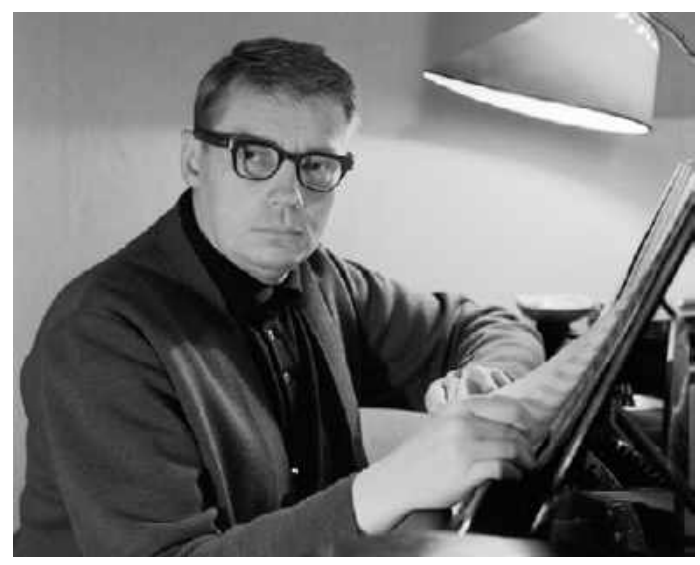
Boris Tchaikovsky, 1974.

September 13 — opera singer (lyrico-dramatic soprano), National Artist of the USSR, the Bolshoi Opera soloist in 1958-1988 Tamara Milashkina