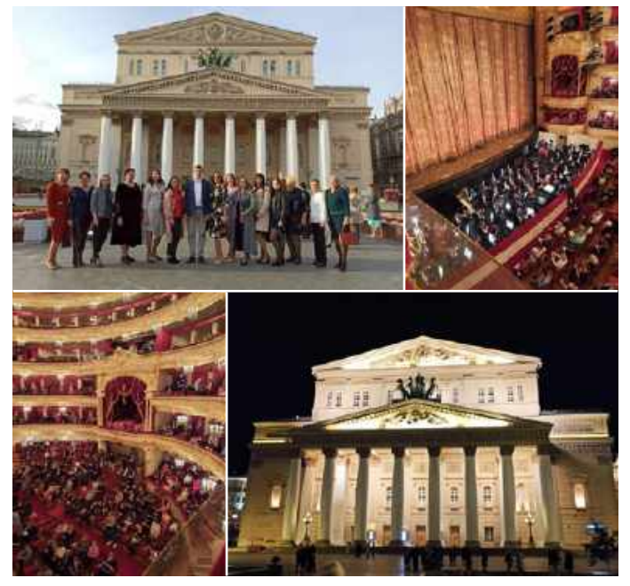
City doctors fighting the coronavirus went to the Bolshoi Theatre"