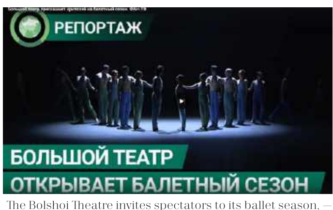
The Bolshoi Theatre invites spectators to its ballet season, — <u>FAN-NV video report</u>

<u>Nofixedpoints</u> offers its readers an extensive illustrated story about the night at the Bolshoi.