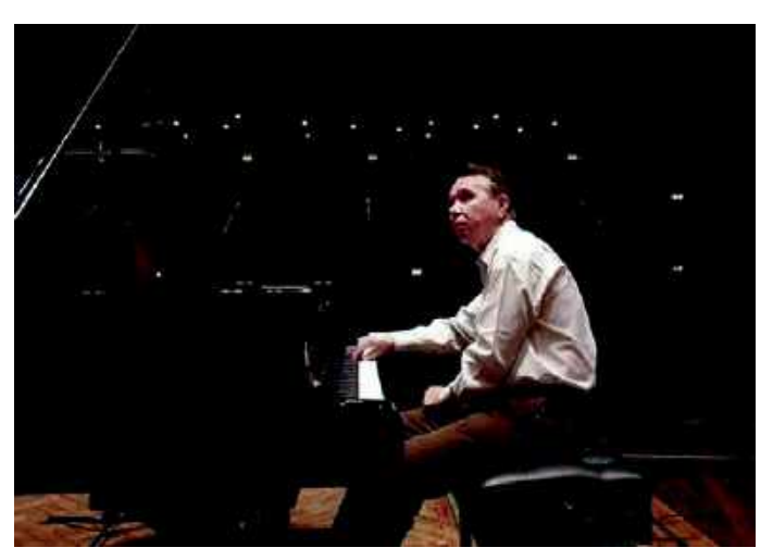
Mikhail Pletnyov

Ludwig van Beethoven's pieces have been played in the first programme of the festival-homage to the 250th anniversary of the birth of the composer, the celebration of which is taking place in musical halls across the world, reports <u>Rossiiskaya Gazeta</u>. — The Fight Over Beethoven. "Mikhail Pletnyov, who is considered to be an exceptional interpreter of the piano heritage of Beethoven, performed in the Tchaikovsky Hall as a soloist, having played the third piano concerto of Beethoven. The orchestra was conducted by Vasily Petrenko, who opened the programme of the XII Bolshoi Festival with the Beethoven overture Egmont. During the second part of the concert, Johannes Brahms's Fourth Symphony was played."