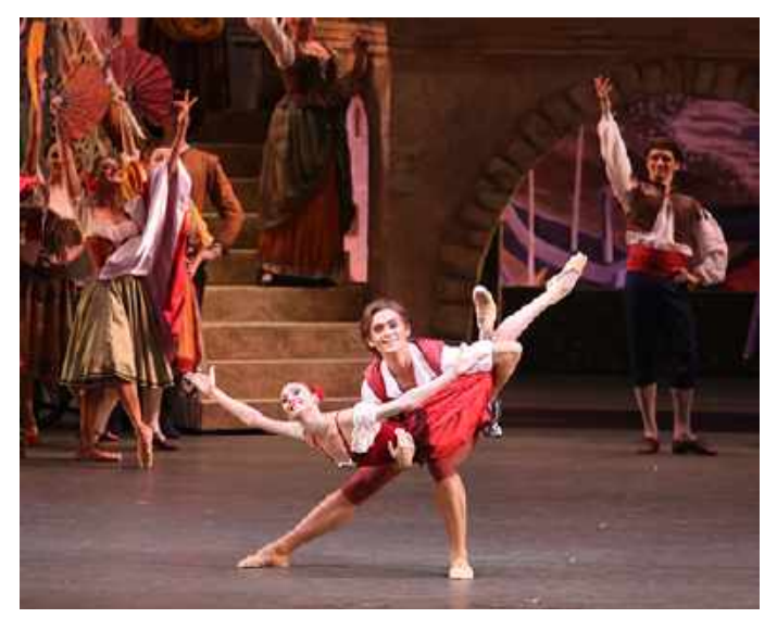
Svetlana Zakharova and Denis Rodkin in <u>Don Quixote</u> to the music by Ludwig Minkus at the Bolshoi Historic Stage.