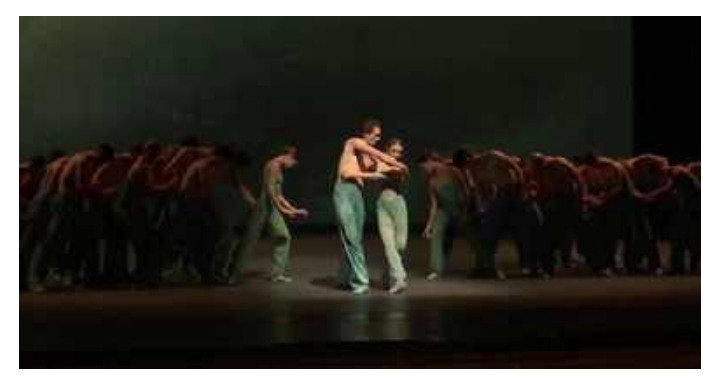
"The Bolshoi Theatre's first performance since reopening its doors will see dancers perform a COVID-19 inspired routine."

<u>CGTN Français</u> (September 14) — in French <u>CGTNEurope</u> (September 15) — in English