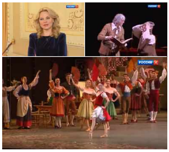
The Bolshoi Theatre Gave A Performance For Medical Workers

The RF Government Deputy Prime Minister Tatiana Golikova addressed the audience before the performance: "First of all I want to congratulate the Bolshoi Theatre because today here — after a long break caused by the pandemic — world and Russian ballet stars will be dancing for you. We decided to give this first performance for you, dear medical workers. For you who made this show possible."